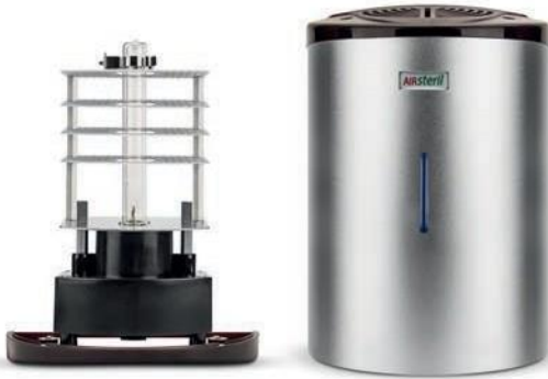
AS10 // AS10X