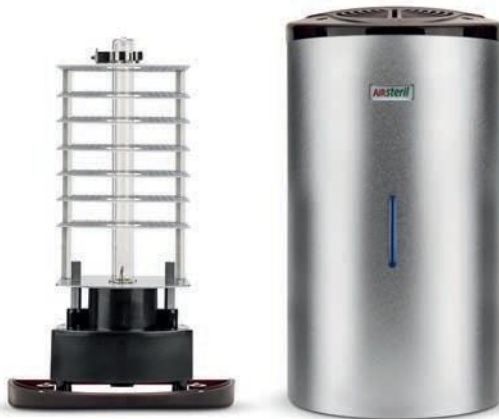
AS20 // AS20X // AS20M